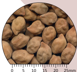
PBA HatTrick ®