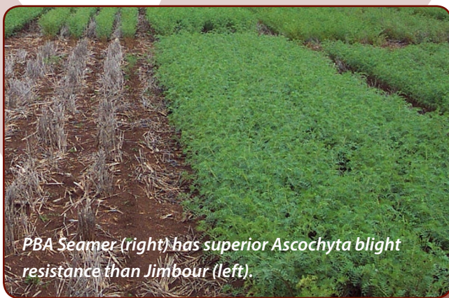
PBA Seamer (right) has superior Ascochyta blight resistance than Jimbour (left).